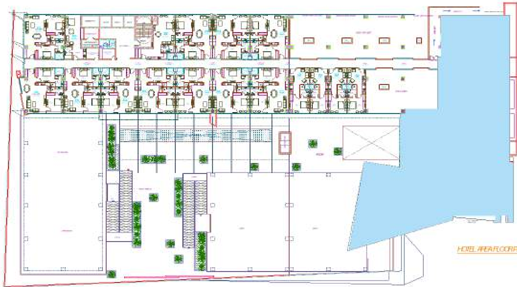
HOTEL AREA FLOORPLAN